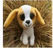
Cookie is the ambassador for Paraparaumu Beach School.

Follow this link to find out more about Cookie and LEARNZ. http://www.learnz.org.nz/antarctica184/ambassadors